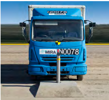
Safetyflex also offer a selection of shrouds and street furniture. Details available on request.