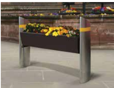
Safetyflex also offer a selection of shrouds and street furniture. Details available on request.

Supplier of anti-terrorist bollards (Olympic venues) to the London 2012 Games