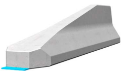
Terminal element REBLOC 80X_4T (inclination 1:5)